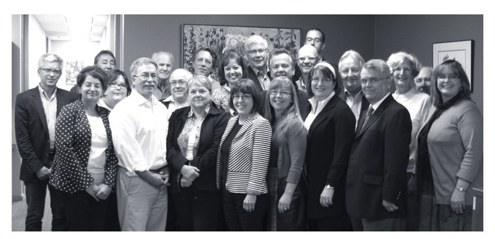
Representatives from law foundations across Canada met in Vancouver in 2013 for the annual conference of the Association of Canadian Law Foundations

Tel: 604-688-2337 Fax: 604-688-4586 info@lawfoundationbc.org www.lawfoundationbc.org