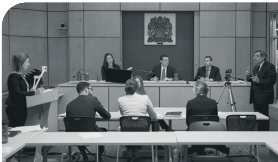
Students receive training in the Law Centre's moot courtroom

Each BC law school receives support for clinics where law students develop practical skills. Public Interest Work Placements, Pro Bono Students Canada and the Judicial Interns Circuit Court Program are other avenues for students to learn about practical applications of the law. Public interest awards and graduate fellowships provide further opportunities. The foundation also supports students after law school by funding one articling position per year and providing some students who need assistance with funding to attend the Professional Legal Training Course. Courthouse Libraries BC has developed several free professional development webinars for lawyers. Executive directors and advocates from Law Foundation-funded groups, and the supervising lawyers who work with them, have access to professional development opportunities at conferences organized by the Law Foundation. PovNet provides support for advocates and others through its website, listservs and webinars.